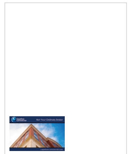
Eighth page 3.75x2.375