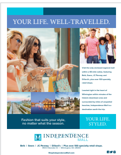
Full page Live 7.75x10.25 Trim 8.5x11 Bleed 8.75x11.25