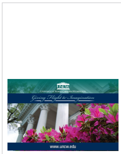
Half page Horizontal 7.75x5.0