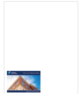
Eighth page 3.75x2.375

Payment and ads due by Friday, February 2 nd