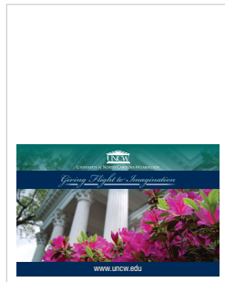
Half page Horizontal 7.75x5.0