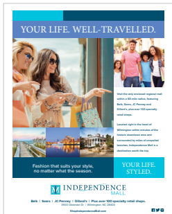
Full page Live 7.75x10.25 Trim 8.5x11 Bleed 8.75x11.25